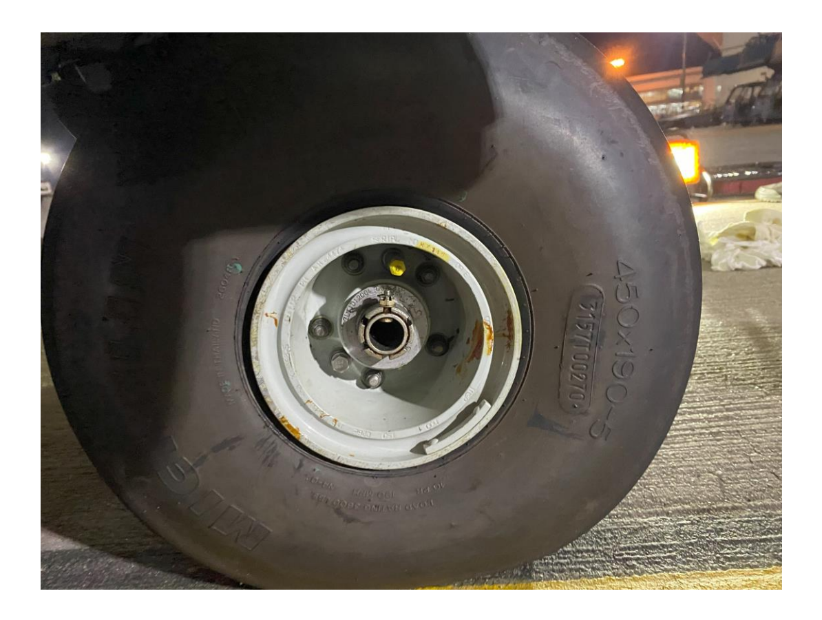
Figure 7: Right wheel of the NLG