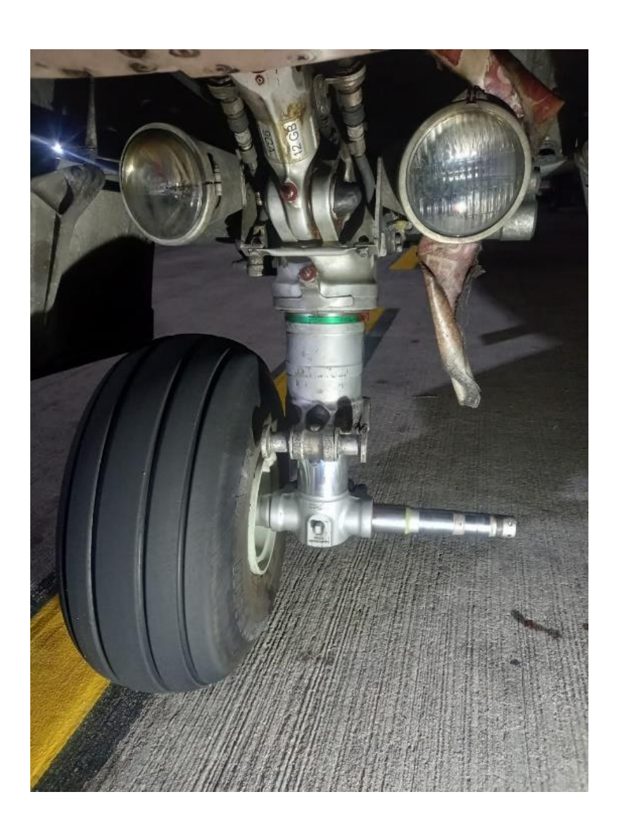
Figure 5: Nose wheel assembly of 5N-GAA post-occurrence