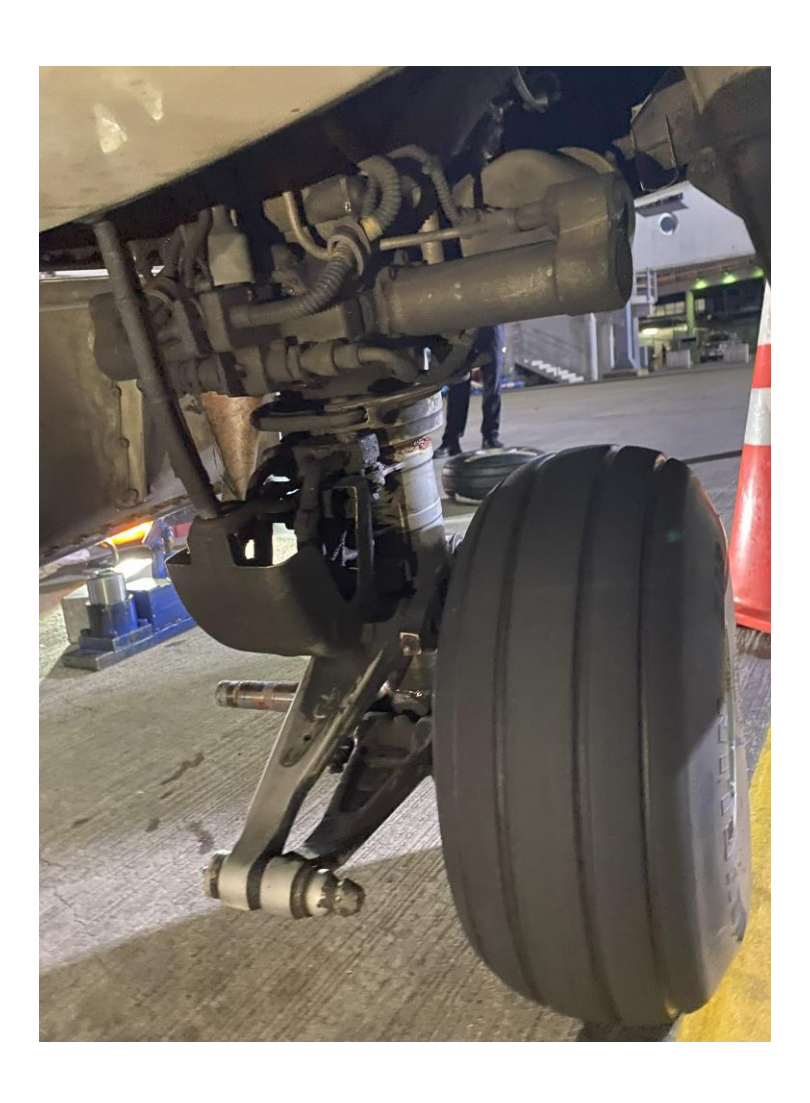
Figure 6: Nose wheel assembly of 5N-GAA