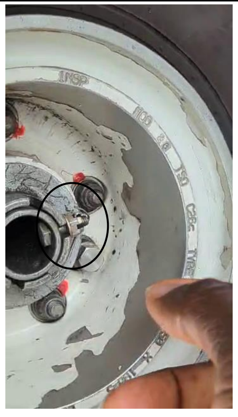
Figure 2: Lock-nut