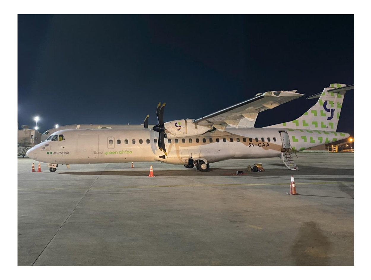
Figure 1: Parked 5N-GAA at NAIA