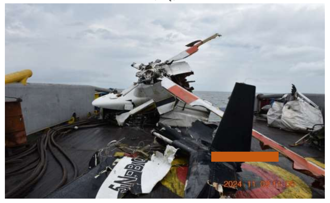
Figure 1: Helicopter wreckage after recovery from the ocean