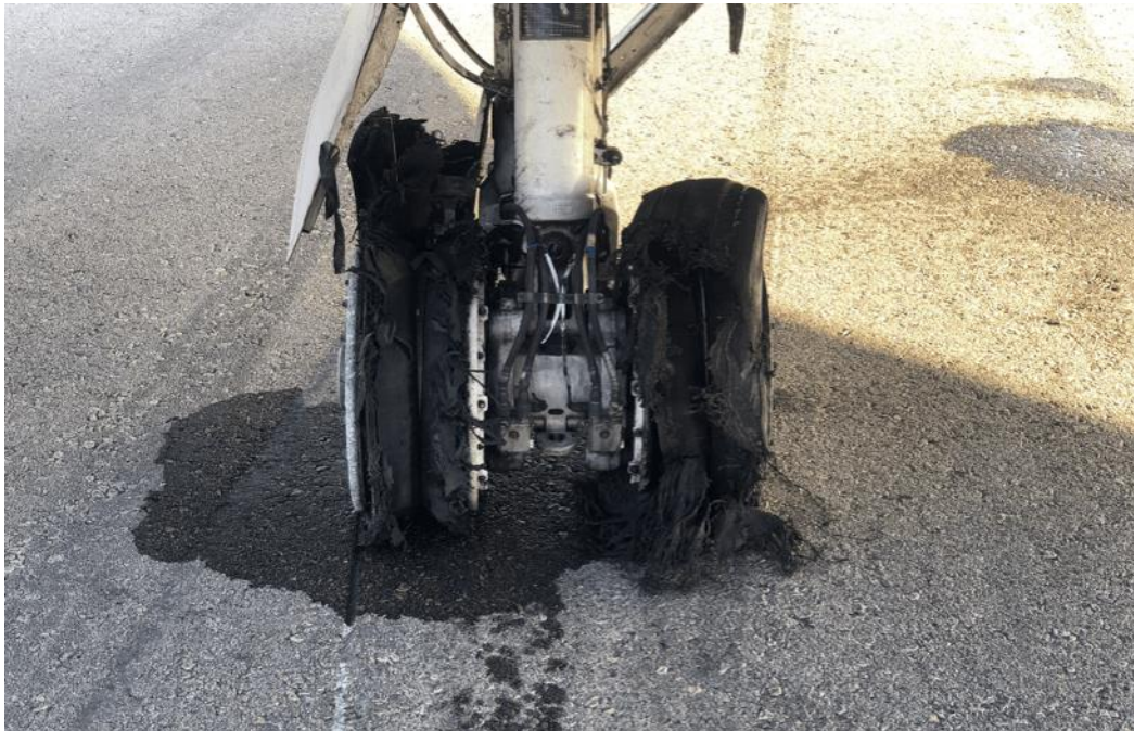
Figure 6: Spillage of hydraulic fluid observed underneath the left main landing gear