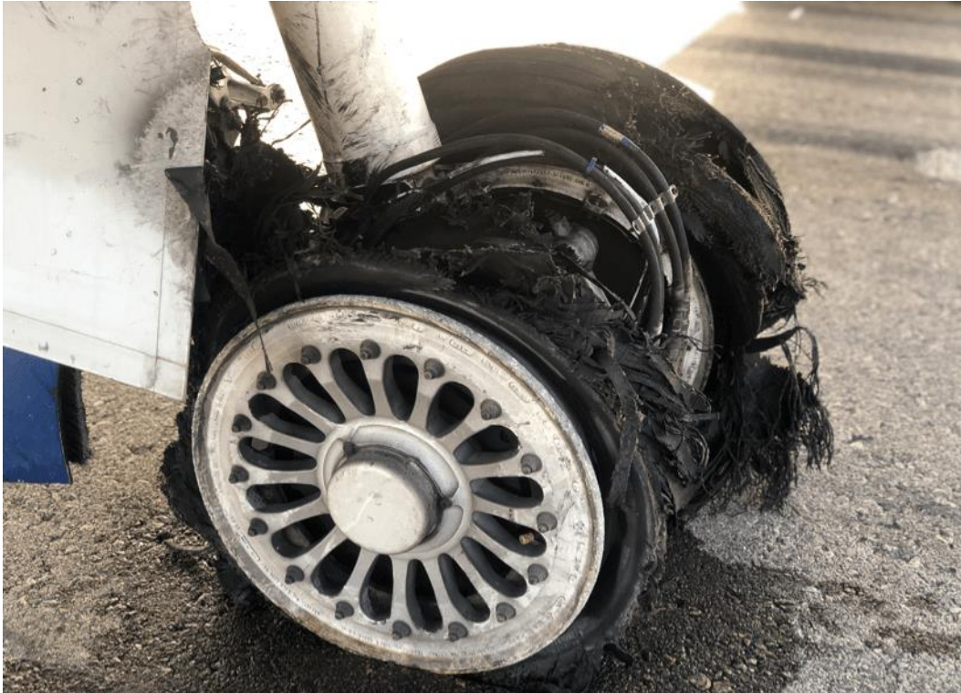
Figure 5: Abraded number 1 left main wheel hub