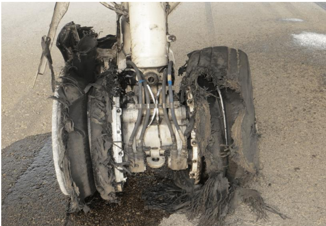
Figure 3: Damaged number 1 and number 2 main wheel tyres