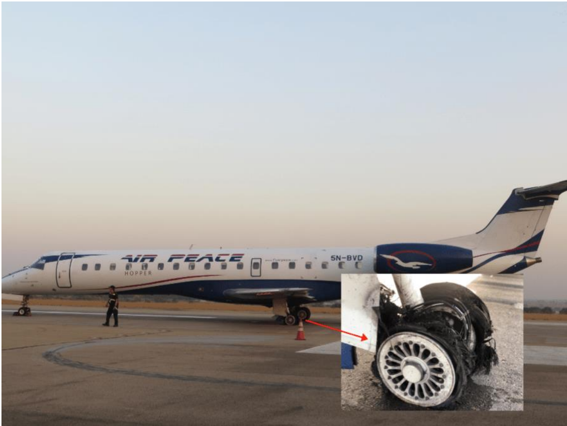
Figure 1: EMB-145 LR with registration marks 5N-BVD

The maintenance job card JC NO.: E145001APL-EMB for the aircraft showed that the night before the incident (13th January 2021), a routine post-flight inspection was carried out on 5N-BVD and the hydraulic system 1 and 2 reservoir fluid levels were checked and refilled with five (5) quarts of Skydrol LD4 fire resistant hydraulic fluid.