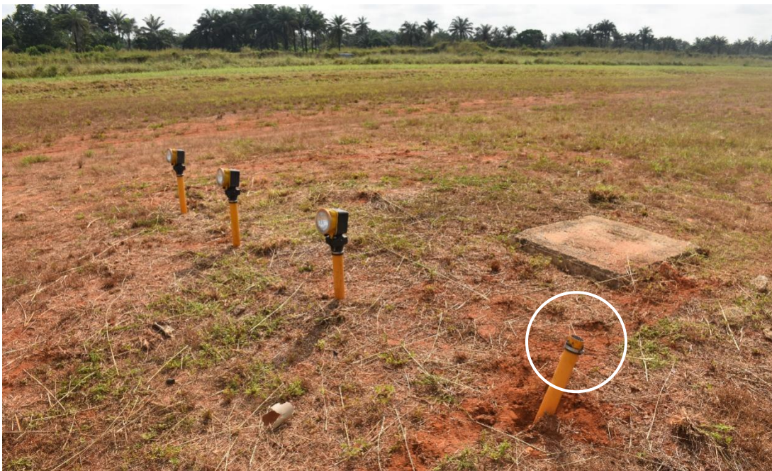
Figure 1: A damaged approach light on Row 11

Nine approach lights on the Approach Path of Runway 17 were damaged.