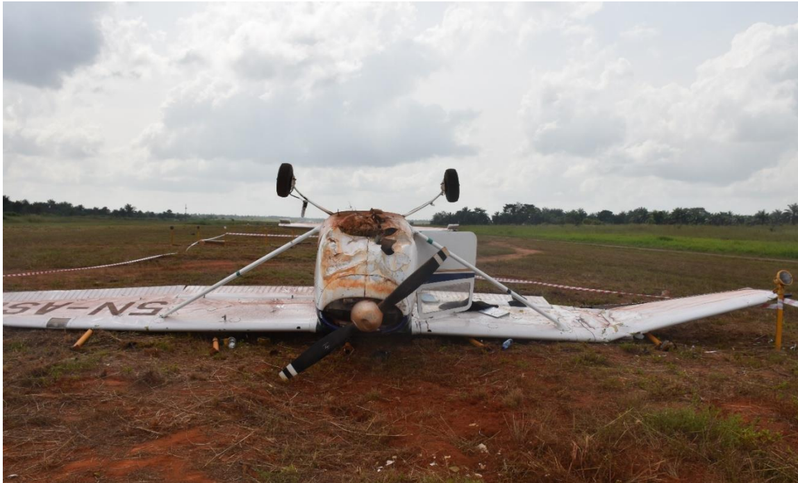
Figure 6: Aircraft at its final position