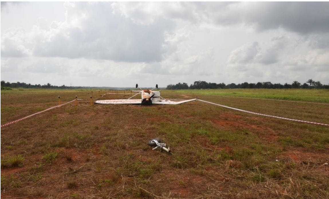
Figure 7: Some views of the aircraft at the occurrence site