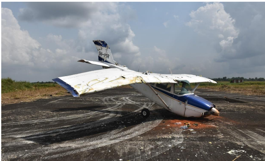
Figure 12: The aircraft after wreckage recovery