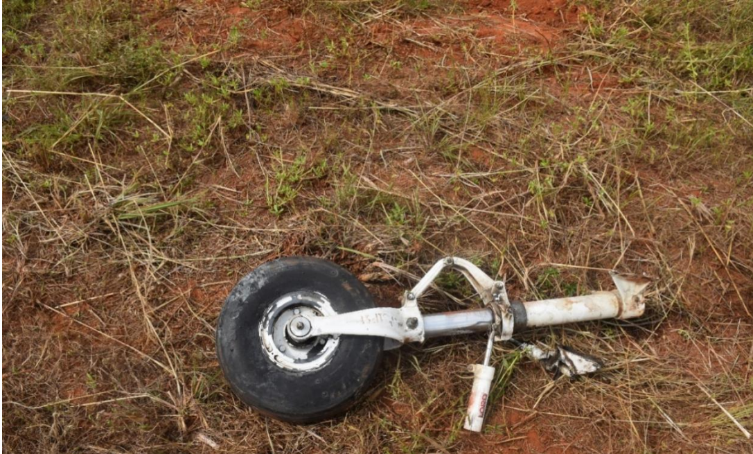
Figure 8: The detached nose landing gear