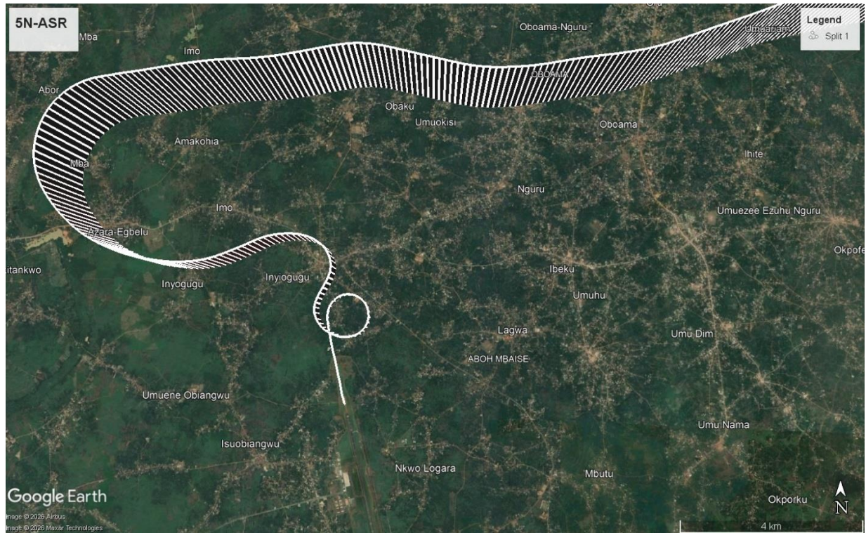
Figure 4: Final Portion of the flight