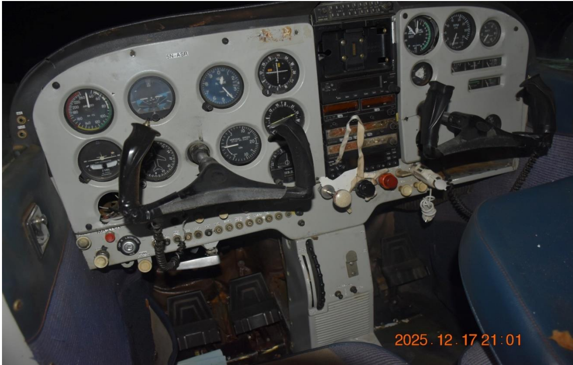
Figure 10: The aircraft cockpit area