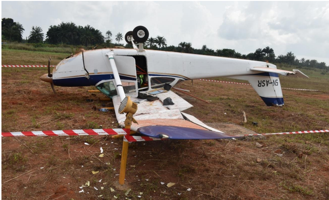
Figure 5: Aircraft final position viewed from the right side

transfer marks from impact with an Approach Light. The Stabiliser Tip Fairing had been dislodged and was not found.