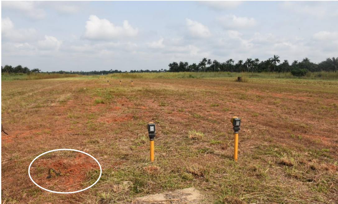
Figure 2: Another damaged approach light on Row 10