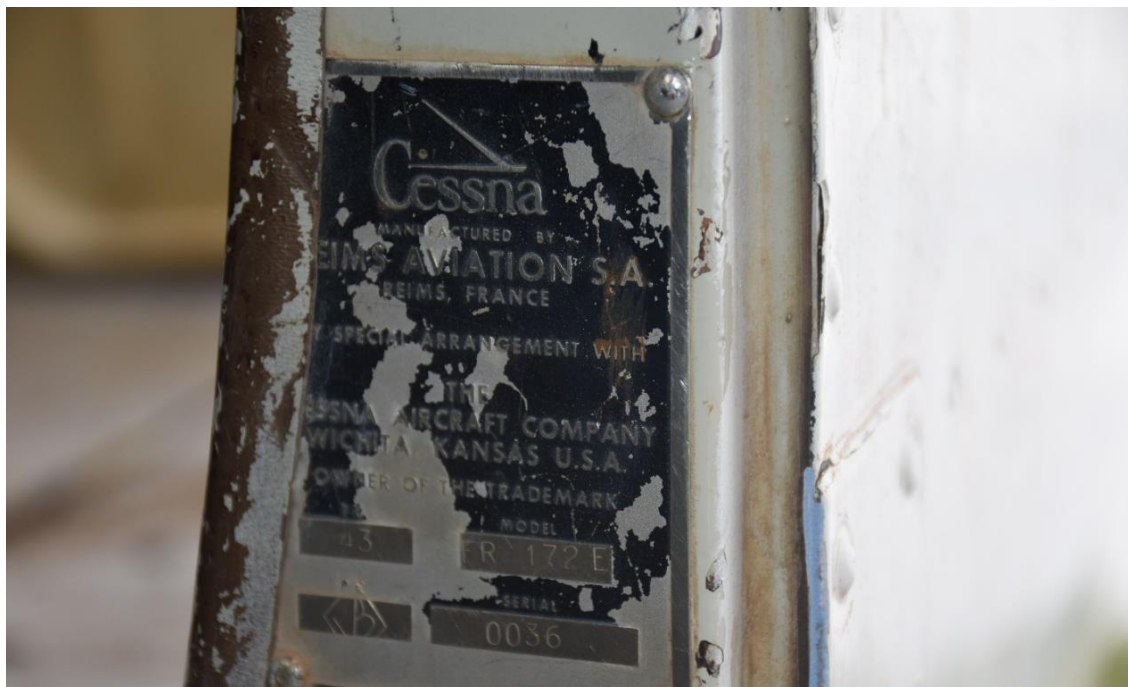
Figure 11: The aircraft name plate