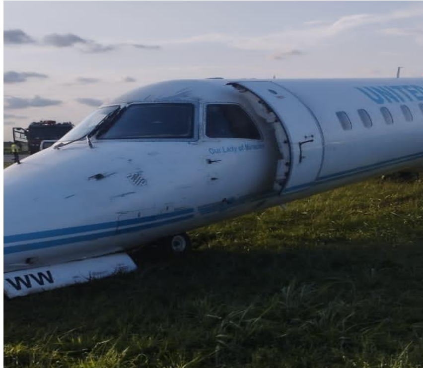
Figure 4: The collapsed nose wheel landing gear