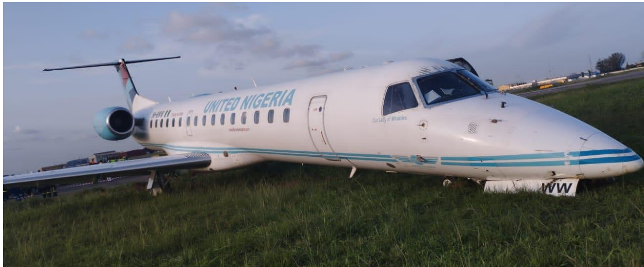
Figure 2: The aircraft where it stopped on the grass verge

the grass verge. It further moved on the grass verge, crossed a drainage channel onto the paved way at Link B3, a distance of about 1,760 m and continued onto the grass verge on the other side of the link. The aircraft then crossed another drainage channel and having travelled a total distance of about 1,860 m from the runway threshold, came to a stop. In the process, the aircraft nose landing gear assembly collapsed.