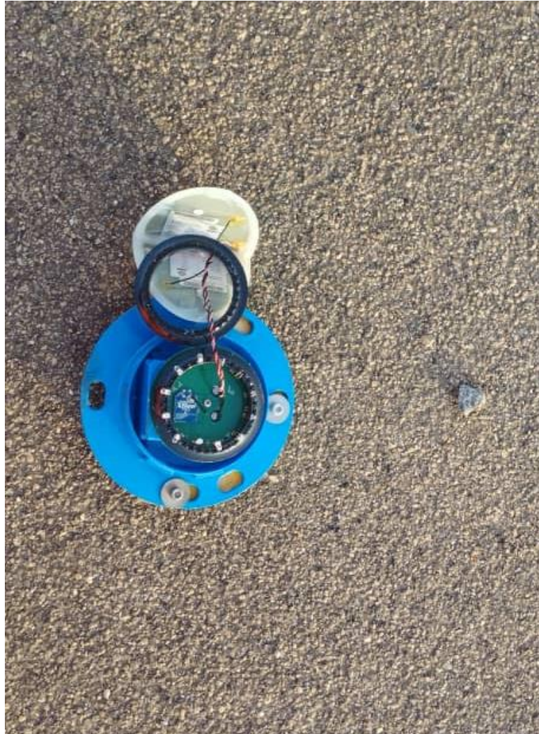
Figure 1: Picture of broken taxiway edge light