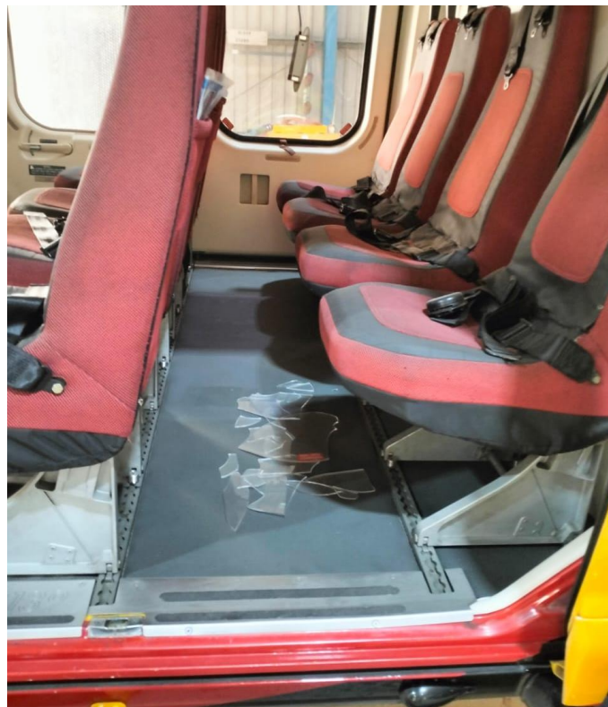
Figure 2: Views of the cabin post occurrence showing some damage