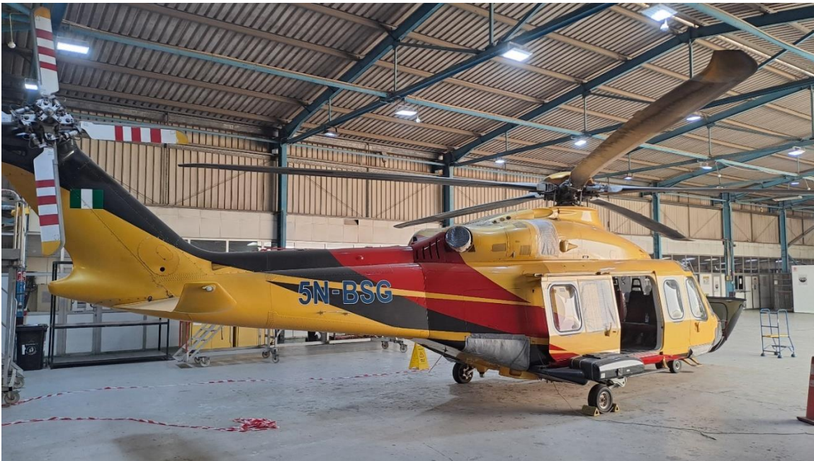
Figure 1: The aircraft parked in the hangar after the occurrence